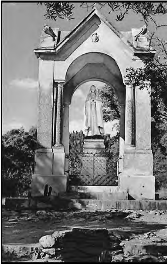
Shrine at Valinhos

endure any sacrifice to save sinners from Hell. They even wore the rope to bed. This prevented them from getting the rest they needed and Our Lady spoke about it in Her next visit.