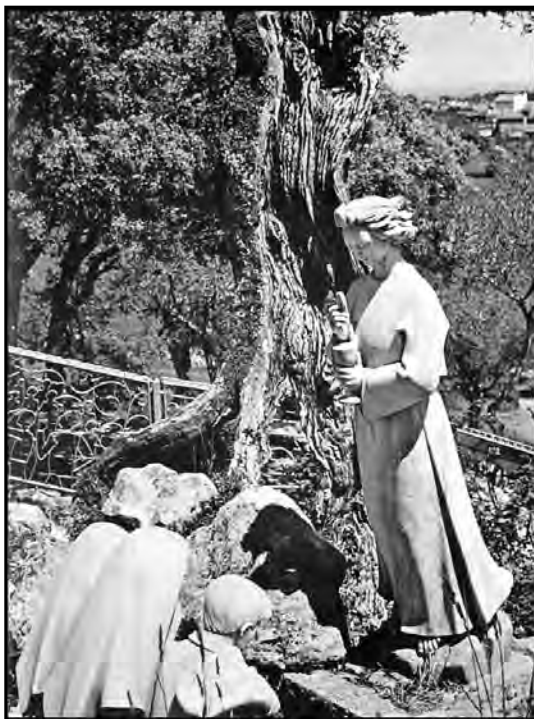
This statuary group stands on the spot where the three children saw the Angel and received Holy Communion from him.

The Angel then arose, and holding the chalice and the Host again, he gave the Host to Lucia, and the contents of the chalice to Jacinta and Francisco, while he said: