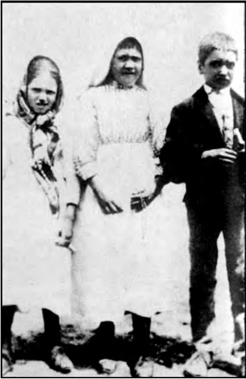
Jacinta Marto (age seven), Lucia dos Santos (age ten) and Francisco Marto (age nine), the three seers to whom Our Lady appeared at Fatima in 1917.