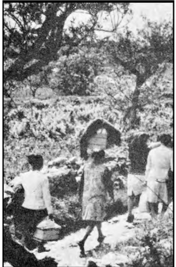
Photo shown is that of the countryside near Fatima. It looks as it was in 1917.

The two mothers, still hiding behind the bushes, felt all strength gone from them. When they saw the crowd milling around their children, Jacinta's mother cried out, "Oh, good Mother, they are killing our children!" How relieved both were a few moments later to see Jacinta on the shoulders of her father, Francisco in the arms of a relative, and Lucia being carried by a very tall man, so tall in fact that Lucia's mother was distracted from her worry. "Oh, what a big man," she blurted out.