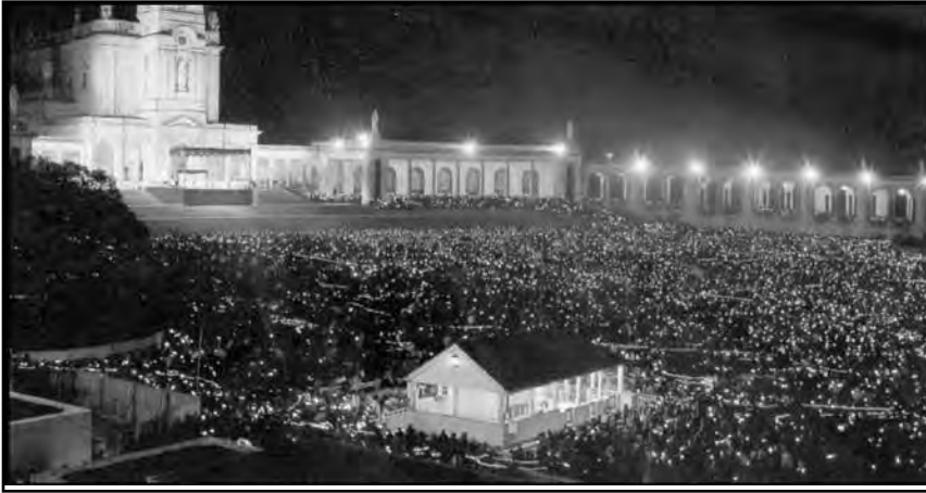
The great esplanade before the Fatima Basilica was filled on May 12, 1967 with people the evening before the Holy Father Pope Paul VI arrived at Fatima.

Lucia then went to Valinhos, where Our Lady appeared after the children's imprisonment. She knelt beside the little holm oak whereon Our Lady had stood, though the tree had long since been stripped of all its branches by pious pilgrims. She spent quite a while there, then rose from her knees, walked on past the bog and the little pond where the three used to graze