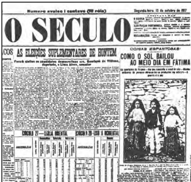
The front page of the anti-clerical paper O Seculo , a major Portuguese newspaper, reporting in great detail the Miracle of the Sun.

And though she never spoke of Fatima, she did speak to them often of Our Lady, how beautiful and kind She was and what all should do to please Her. Lucia inspired in all an ardent love for Mary. And when she finished her course of studies, she asked if she might be admitted into the Order of the good sisters who had taken care of her, the Sisters of St. Dorothy. They were happy to welcome this sweet and holy girl into their midst.