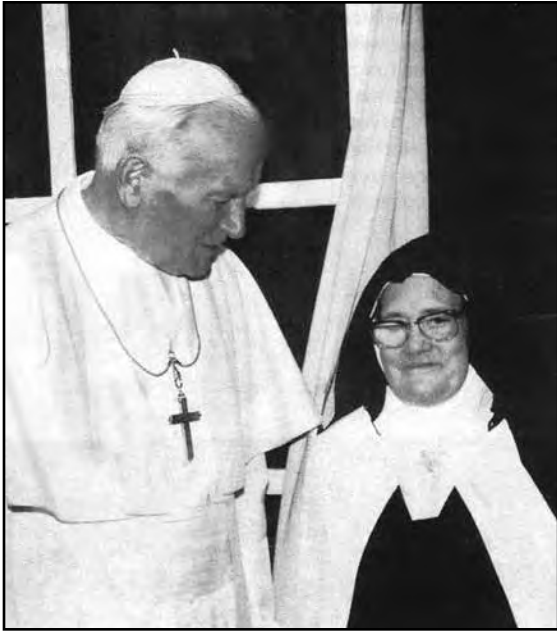
On May 13, 1982, 1991 and 2000, Sister Lucia met Pope John Paul II at Fatima.

Six weeks later, on the Feast of the Immaculate Conception, in the presence of 40,000 people, the Holy Father repeated this consecration at St. Peter's in Rome. This consecration was a decisive event in the history of the world, and would bring about an early end to World War II. It was not, however, the consecration Our Lady asked for, and thus did not bring about the conversion of Russia and the lasting peace She promised us.