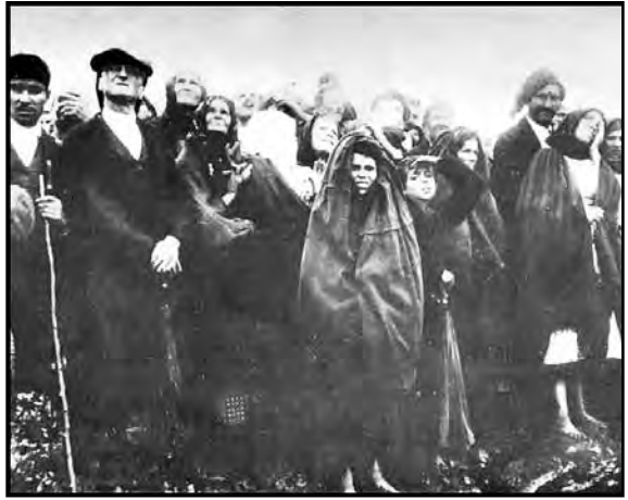
Fatima, noon, October 13, 1917. Before (left) and during (right) the great miracle.

robes of Our Lady of Sorrows, but without the sword. Finally, the Blessed Virgin appeared again to Lucia in all Her ethereal brightness, clothed in the simple brown robes of Mount Carmel. 1