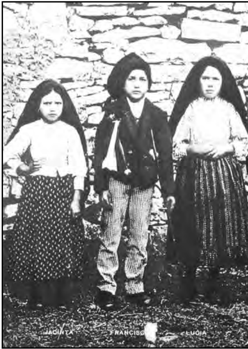
The three Fatima children, Lucia dos Santos (right) and her two cousins, Jacinta and Francisco Marto.

repeated this prayer three times. Then he arose and said: