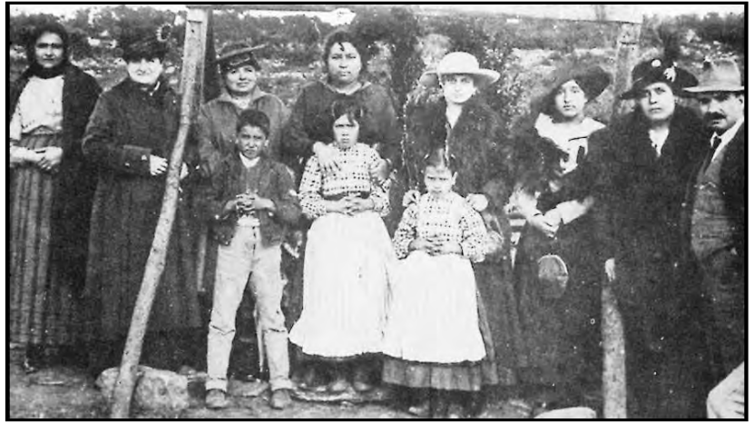
The three children are shown standing under the arch erected on the site of the apparitions in this photo taken shortly after October 13th.

“Fearing impairment of the retina, which was improbable, because then I would not have seen everything in purple, I turned about, closed my eyes, cupping my hands over them, to cut off all light. With my back turned, I opened my eyes and realized that the landscape and the air retained the purple hue.