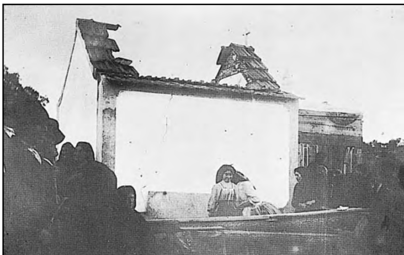
The little chapel built on the site of the apparitions (begun on August 6, 1918) which was shattered by dynamite on March 6, 1922.