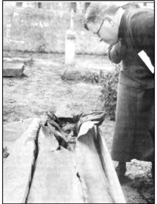
When the tomb of Jacinta was opened in 1951 her body was found practically incorrupt. Her remains are also entombed in the transept of the basilica at the Cova da Iria.

Fifteen years later, on September 12, 1935, the Bishop of Leiria commanded that Jacinta's body be transferred to the cemetery of Fatima. There the bodies of Jacinta and Francisco were to be placed in the same tomb, built especially for the two children. When Jacinta's casket was opened on this occasion, her little body was still whole and incorrupt. Jacinta and Francisco had gone home to rest in the Hearts of Jesus and Mary — to console Them and to pray for the conversion of sinners, for the Holy Father, for priests, and for all who ask their prayerful assistance.