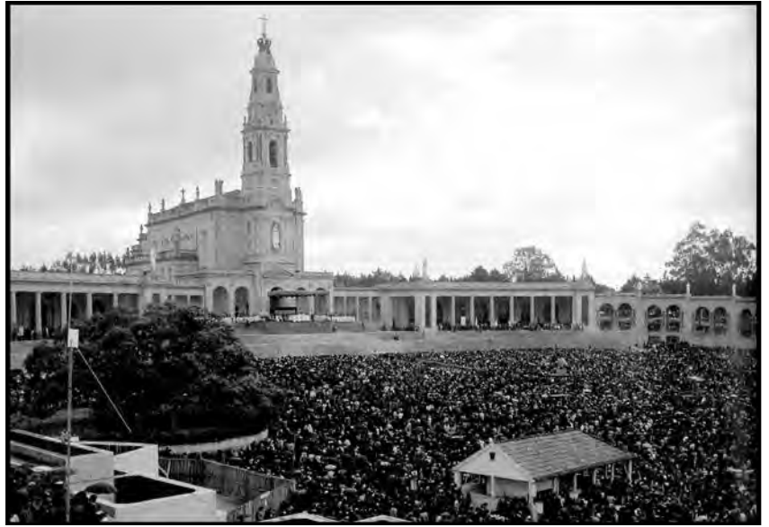
The small building in lower right hand corner, the little chapel (the Capelinha) is built on the exact spot of the apparitions.

that Our Lady said: "I ask for the consecration of the world..." Lucia stopped him. In his book, Vision of Fatima , he recalls that Lucia was emphatic in making the correction about Russia. "No!" she said, "Not the world! Russia! Russia!" Our Lady commanded that the Holy Father consecrate Russia to Her Immaculate Heart and that he command all the bishops to do it in union with him at the same time.