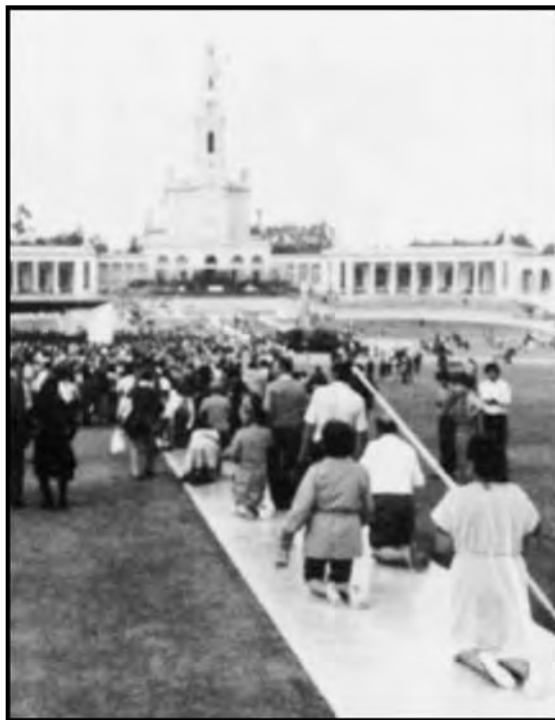
Many pilgrims at Fatima walk the penitential path on their knees. They do this imitating the penance Lucia and all her sisters offered to Our Lady of Fatima in thanksgiving for the cure of their mother.

The Pope at that time consecrated the Church and the world to the Immaculate Heart of Mary, referring obliquely to the people of Russia (but not the country by name) in these words: "Give peace to the peoples separated from us by error or by schism and especially to those who profess such singular devotion to Thee and in whose homes an honored place was ever accorded Thy venerable icon, today perhaps often kept hidden to await better days; bring them back to the one fold of Christ under the one true Shepherd. ..."