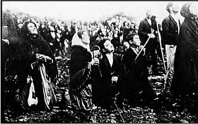
The crowd gathered at the Cova da Iria during the prodigy of the sun. The Portuguese paper O Dia reported that, “The people cried with one voice. Thousands whom faith seemed to transport fell to their knees upon the muddy ground ... All the people were weeping and praying.”

of Coimbra, is most informative and corroborates the others. “As I waited,” he said, “with cool and serene expectation, looking upon the place of the apparitions and with a curiosity that was fading because the hour was passing away so slowly without anything to arouse my attention, I heard the rustle of thousands of voices. I saw the people stretched out over the large field turn about from the point upon which their desires and anxieties had converged so far to the op-