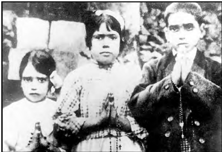
Left to right: Jacinta Marto, Lucia dos Santos, Francisco Marto.

The date of the next apparition was approaching. Jacinta and Francisco were the happiest children in the world. Lucia's heart, however, was filled with gloom and despair; so much so that she made up her mind not to go to the Cova da Iria again. So often did her mother repeat the words of the Pastor that it was the work of the devil, that it upset her.