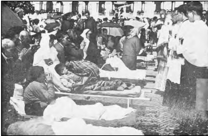
The Blessing of the sick at Fatima.

“Let the people continue to say the Rosary every day to obtain the end of the war,” Our Lady responded, at the same time renewing the promises She made during Her last apparition. “In the last month, in October, I shall perform a miracle so that all may believe in My apparitions. If they had not taken you to the village, the miracle would have been greater. Saint Joseph will come with the Baby Jesus to give peace to the world. Our Lord also will come to bless the people.