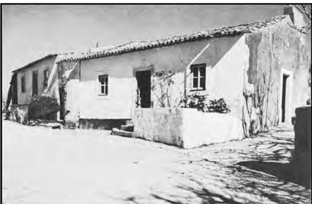
Home where Lucia was born.

Francisco, their youngest boy, was born on June 11, 1908. He grew to be a fine looking lad, having a disposition much like that of his father, Ti Marto, as the parent was usually called. Lucia recalls particularly how calm and condescending Francisco was in contrast to the whimsical and light-hearted Jacinta. Though he loved to play games, it mattered little to him whether he won or lost. In fact there were times when Lucia shunned his company because his apparent lack of temperament irritated her. At these times she would exert her will over him making him sit still by himself for a period of time; then feeling sorry for him she would bring him into the game they might be playing, and Francisco would remain apparently unaffected by the treatment.