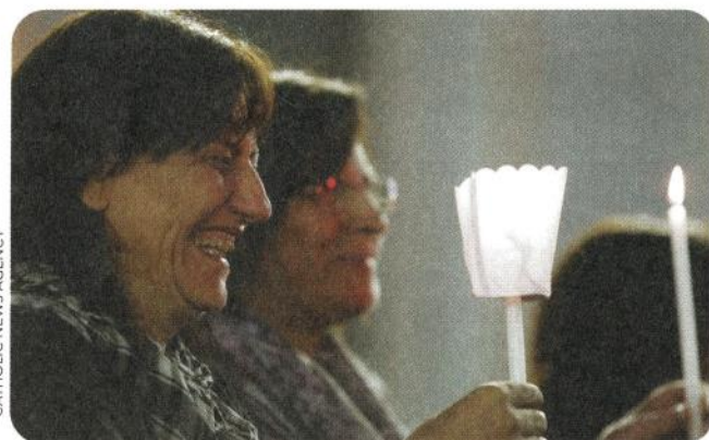
CATHOLIC NEWS AGENCY

What truth do you know now that you did not know ten or twenty years ago?