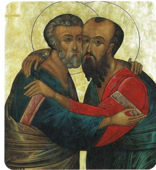
ICON OF APOSTLES ST. PAUL AND ST. PETER ON MAHOGANY

The saints in heaven pray for us on earth; union with them brings us closer to Christ. We pray for those who are being purified after death, and they pray for us. We are one family. The closer our union with God, the closer our union with one another. We have a wonderful goal in life: the promise of union with God and with all those joined to God. ●