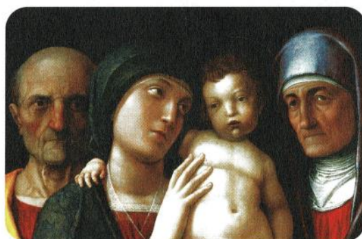
HOLY FAMILY WITH SAINTS ANNE AND JOHN THE BAPTIST (DETAIL), ANDREA MANTEGNA