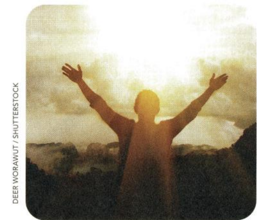
DEER WORAWUT / SHUTTERSTOCK