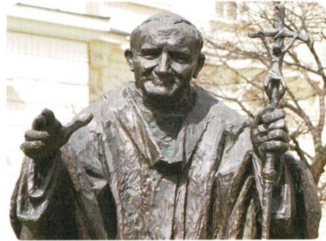
Sculpture of a smiling Pope St. John Paul II outside the Saint John the Baptist Cathedral in Trnava, Slovakia.

Saint Irenaeus (125–202) said that the glory of God is the human fully alive which reflects Jesus' own words, "I came so that they may have life; and have it more abundantly" (John 10:10). Saints enjoy life! The nearsighted St. Alphonsus Liguori (1696–1787), founder of the Redemptorists, sat in the back row of the Naples theater with his glasses off so he could enjoy the music he loved without the distraction of the half-naked chorus line. Saint Teresa of Ávila (1515–1582), caught devouring partridge in the convent kitchen, said, "When I pray, I pray; when I eat partridge, I eat partridge!" Saint Joan of Arc (1412–1431) loved horses, and St. Charles Borromeo (1538–1584) loved chess. Indeed, saints do smile. They even laugh. ●