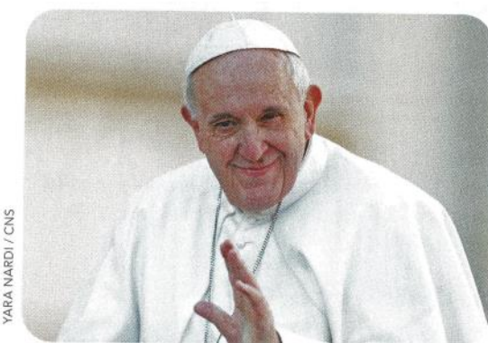
YARA NARDI / CNS